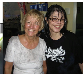
Very good (very wet) sports!!